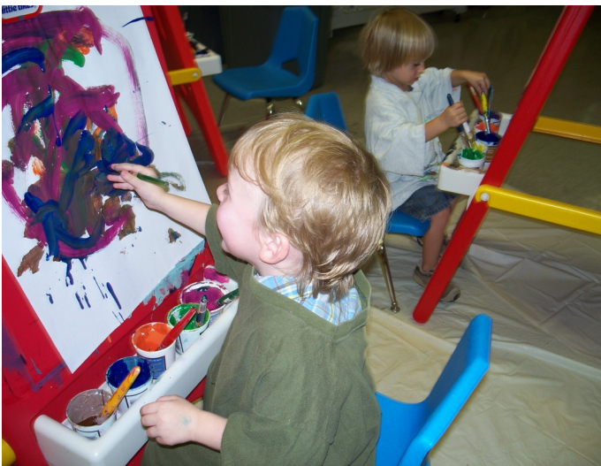
Front: "I love purple."

Dinner is from 5 to 7 p.m. and help is really needed any time after 3:30 and after 7 pm.