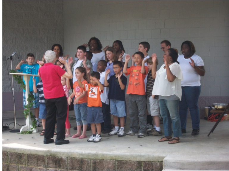
Joint youth choirs of Trinity Reformed UCC and First Congregational UCC sing "Dem Bones Gonna Rise Again" at Worship in the Park on May 15, 2011.