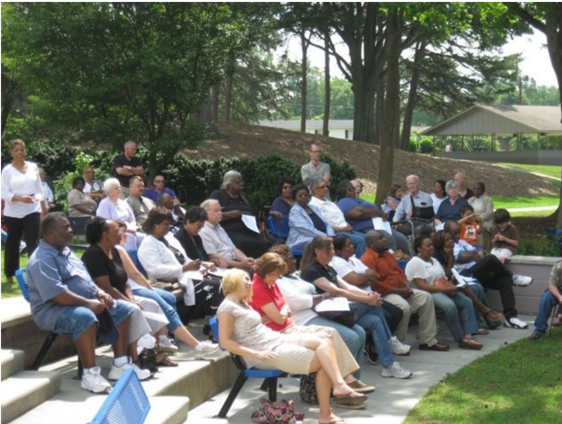
Worship in the Park, May 15

WE'RE ON THE WEB! WWW.TRINITYUCCCONCORD.ORG AND FACEBOOK